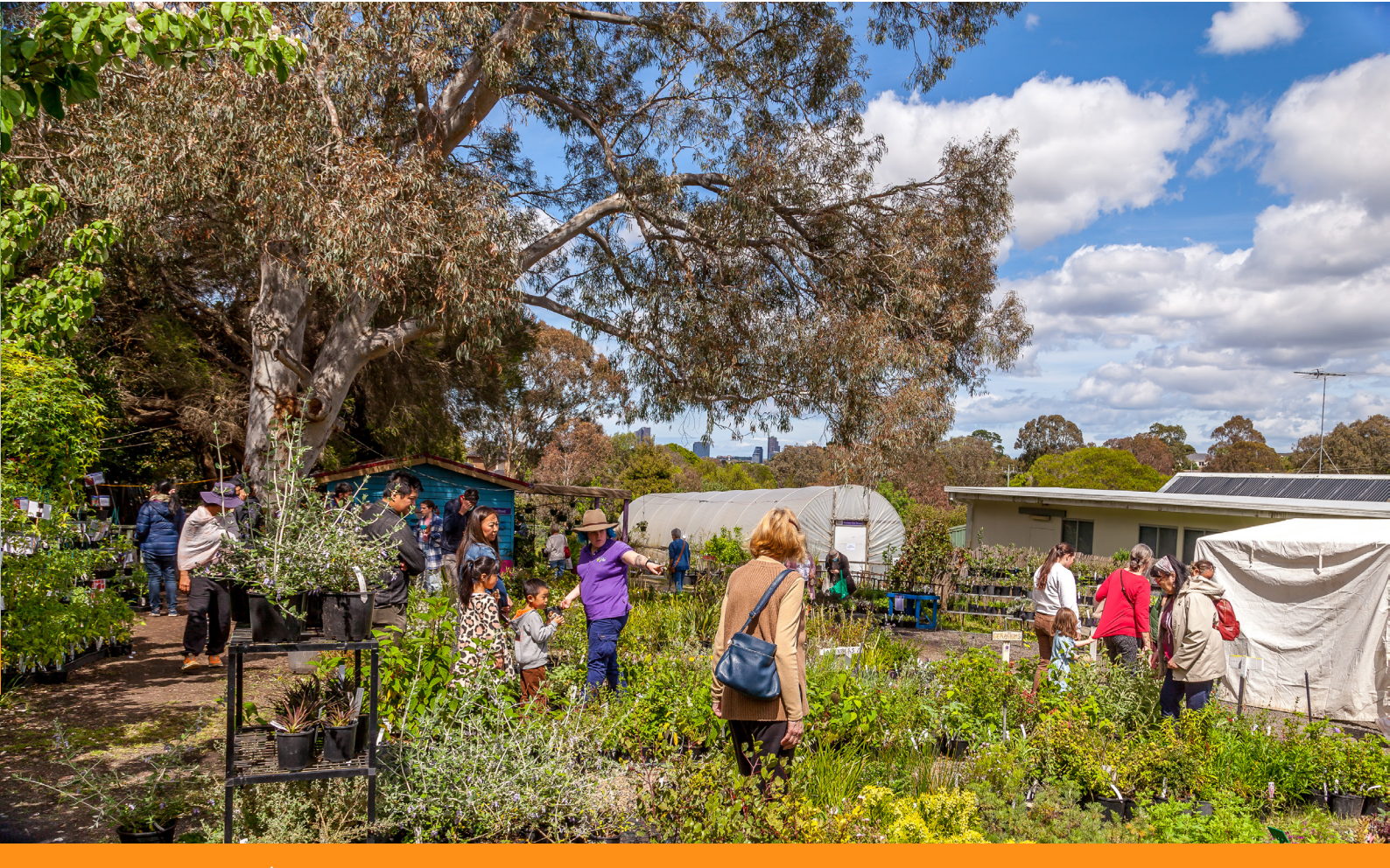
Customers in the Doncaster nursery

At the end of last year, we began a new initiative where participants can apply to participate in our Nursery Hand training scheme. This is a fabulous chance for participants to practice their customer service skills, and regular nursery maintenance.