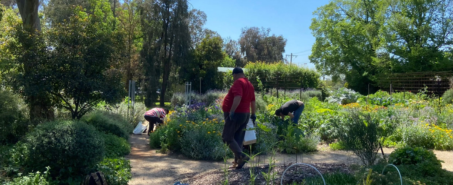
KHG Participants working in the gardens at Heide Museum of Modern Art