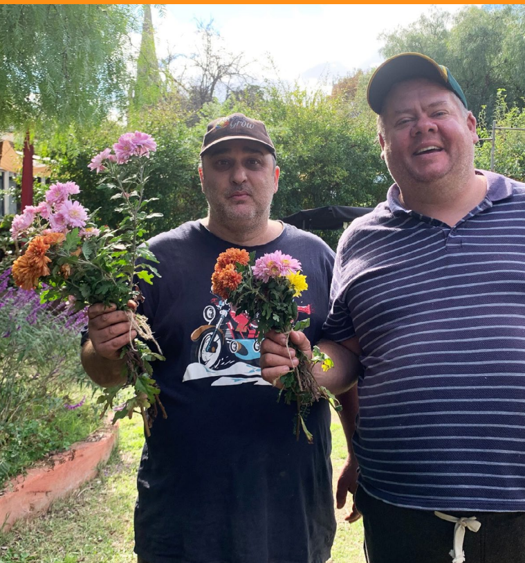
Joe and Joe with flowers they picked from the gardens