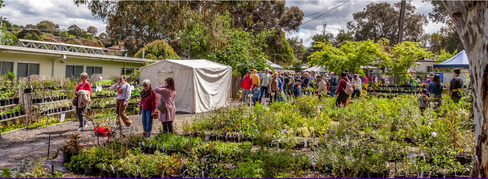
The 2022 Spring Fair at the Doncaster nursery