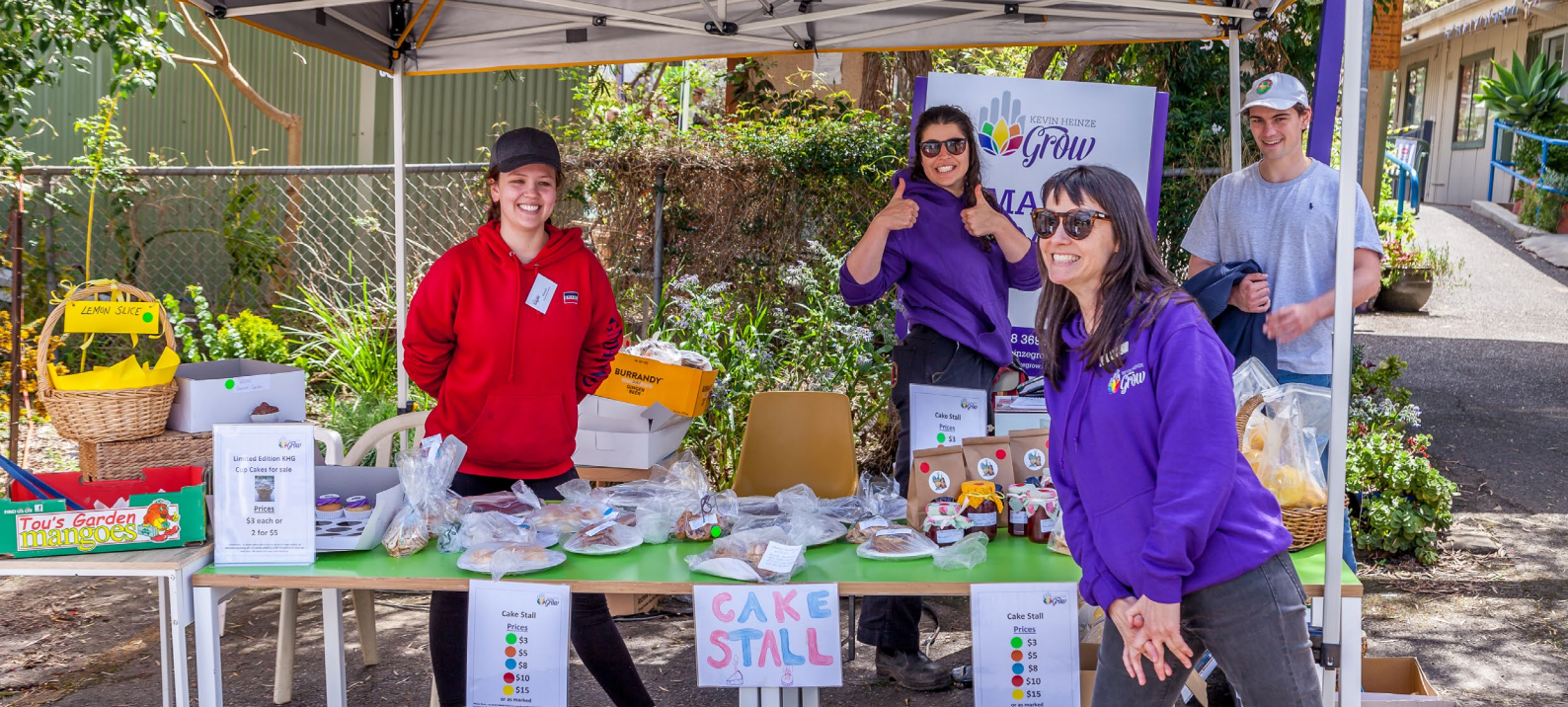
KHG staff at the Spring Fair