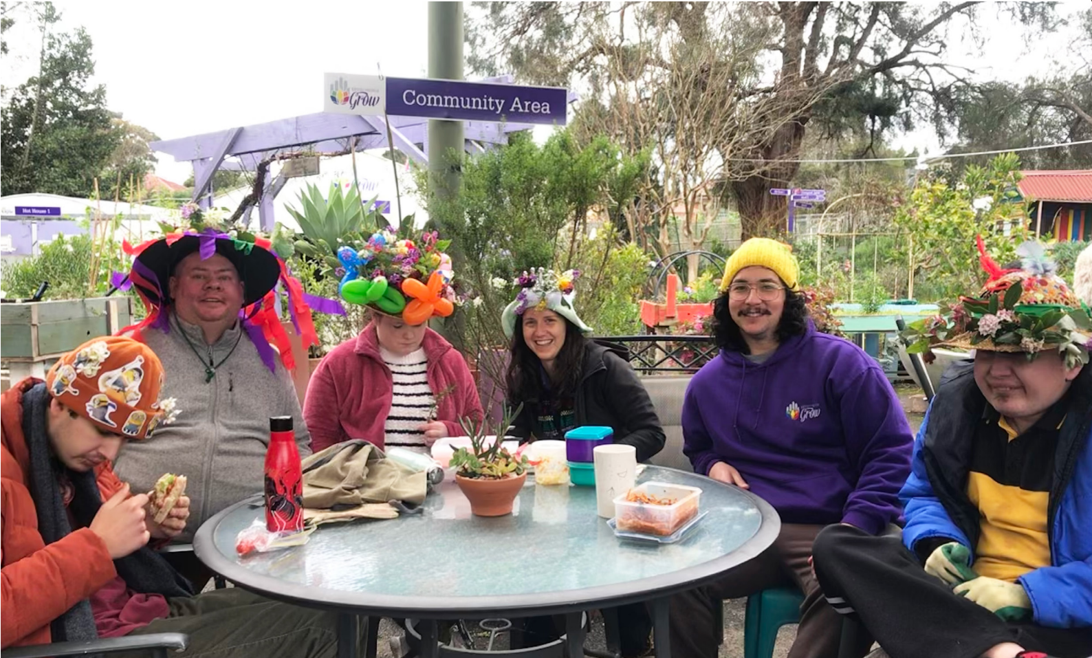
Participants and staff had a fantastic time wearing crazy hats for Brain Injury Awareness Week