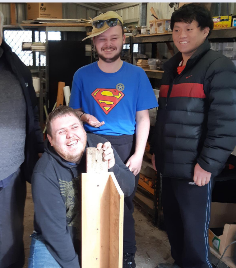
Participants with the bird box they built