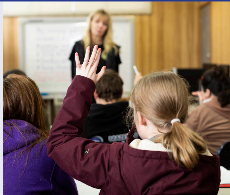
Participants in a TAFE class at KHG

Classes are delivered by qualified TAFE educators and students are supported in