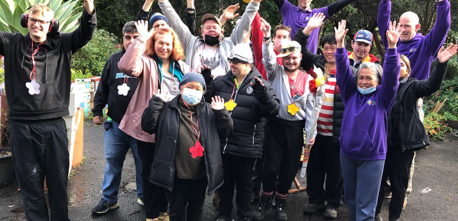
KHG Staff and Participants with their medals from the NAIDOC week themed 'Olympic Games'