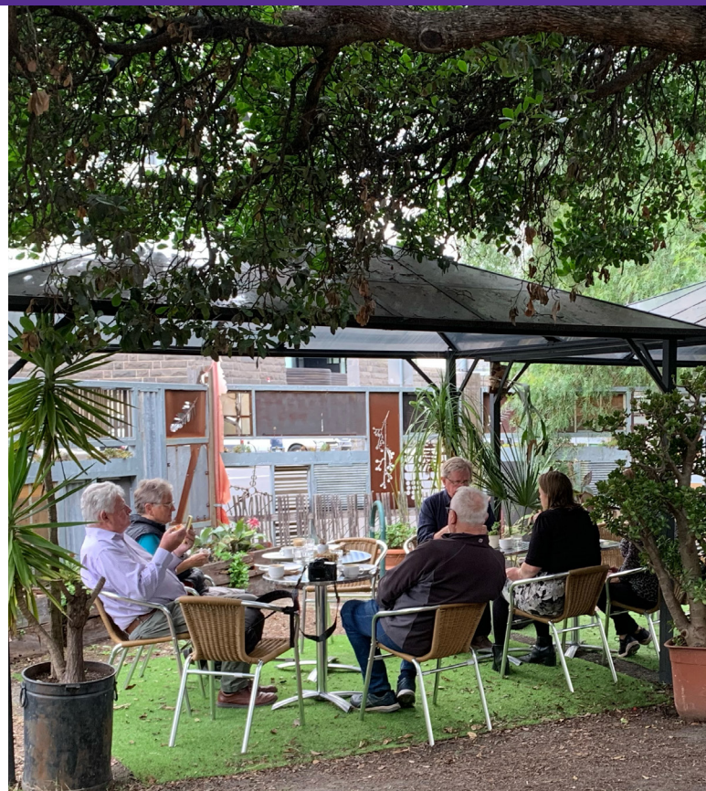
Rotary Moreland members enjoying breakfast at Peppertree Place