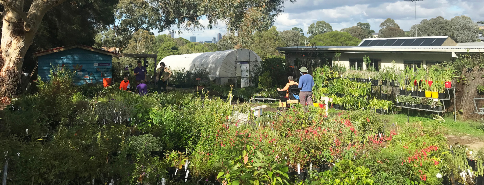
Staff and Participants at the Doncaster Nursery