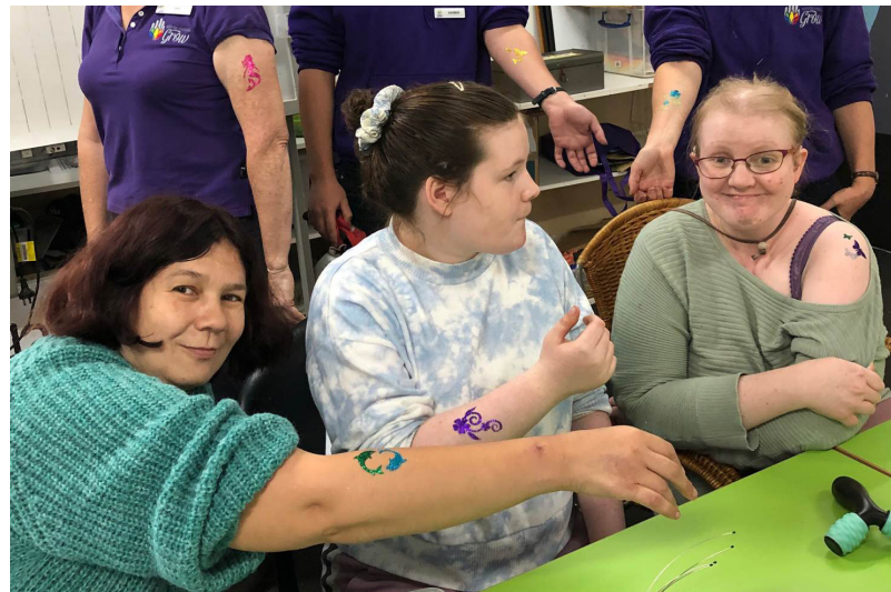
Women's Group and KHG staff showing off their temporary glitter tattoos

The Women's Group have been enjoying reading a variety of new books and talking about anything that the participants wish to chat about. The group have also begun discussing plans for Women's Health Week in September. Participants in the Women's Group enjoy a hot chocolate and a snack as we paint nails and discuss a variety of different topics.