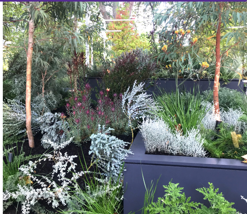
Plants from the KHG Nurseries used in "Tramlines" garden