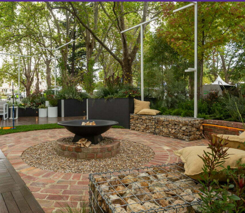
"Tramlines" fully accessible garden

dedicated marquee and display! Thanks to all the KHG staff and volunteers who spent time at our marquee over the show's five days, talking to MIFGS visitors about the great work we do and introducing them to our new 'Gifts in Wills' program.