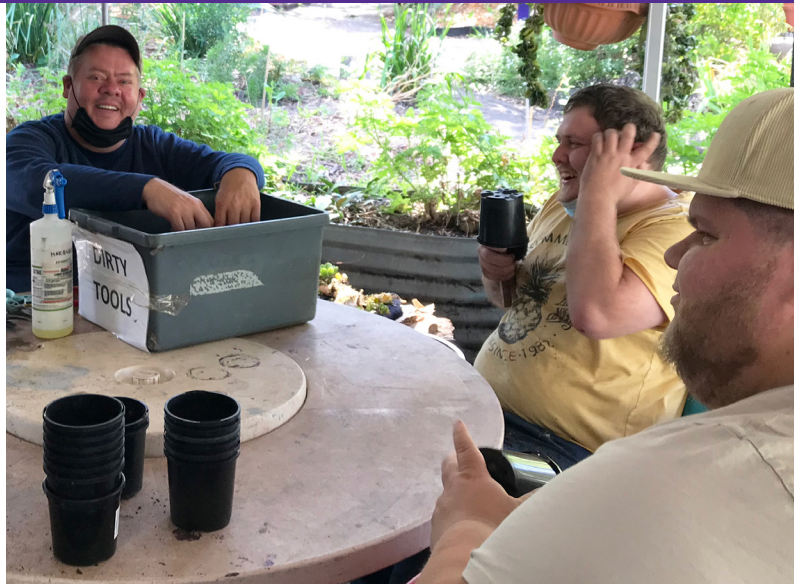
The fellas having a laugh in Men's Group

Men's group is all about sitting around and talking openly about whatever is on your mind without judgement in a safe space. The men's group have chatted about a large variety of topics that were brainstormed by the group at the beginning of the year. They've discussed men's health, cyber security, gambling, addiction, physical health, mental health, relationships and families. The group meets every Tuesday afternoon on site at Kevin Heinze Grow.