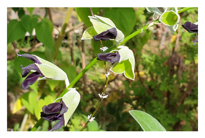
The stunning black Salvia (Salvia Discolor)