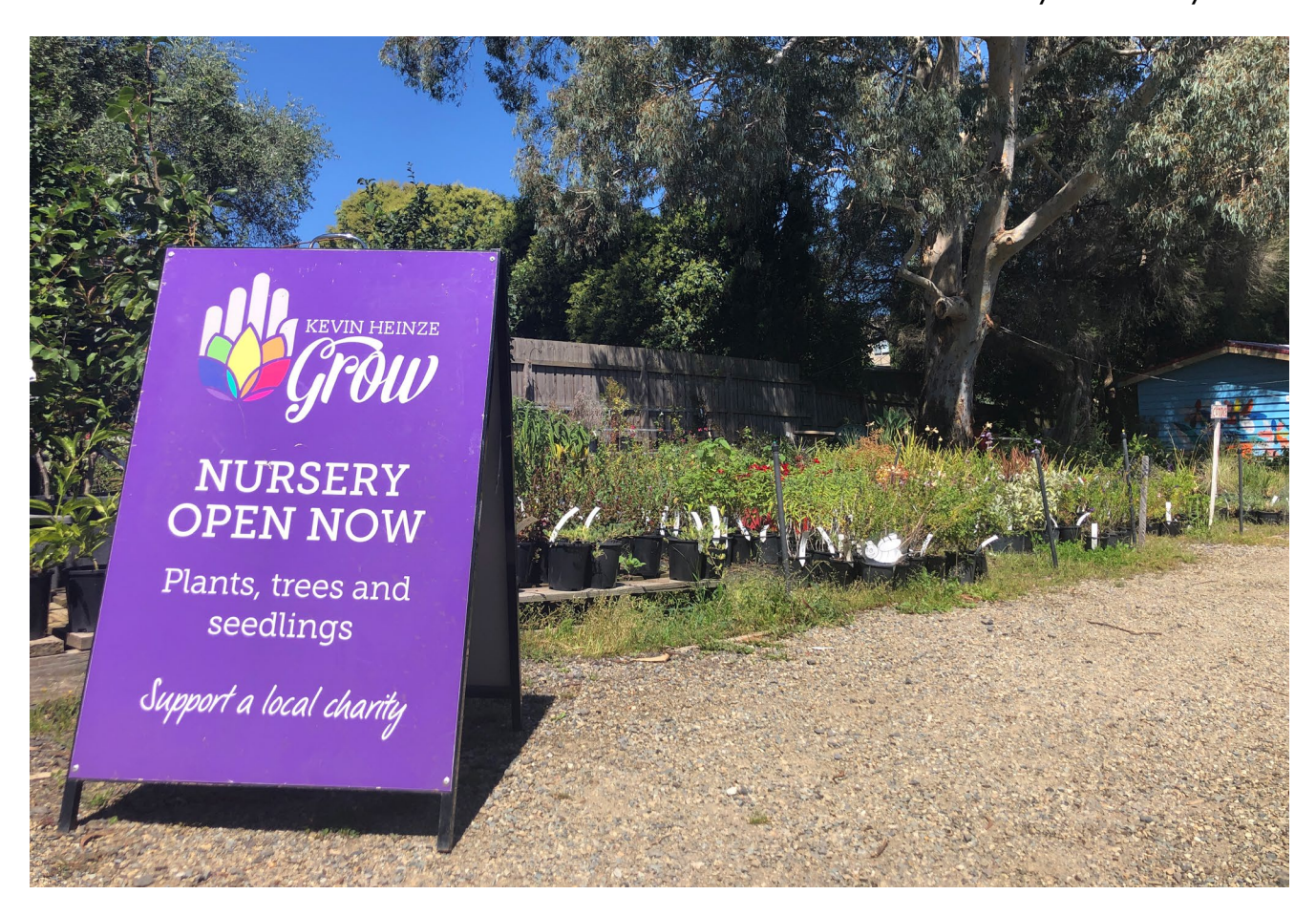
After a brief closure due to Stage 4 lockdown in February, our nurseries are back open again!